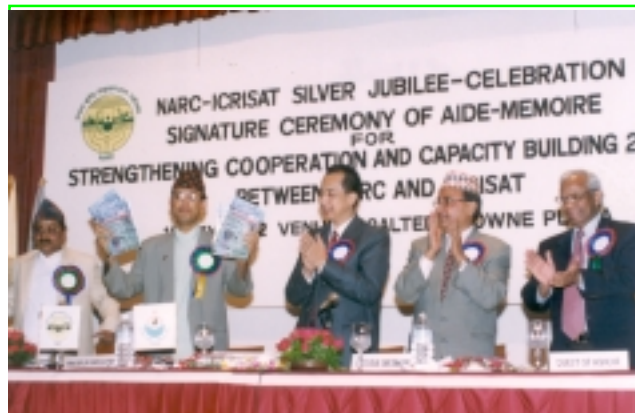
The then Hon'ble Minister for Agriculture releasing NARC-ICRISAT partnership document

The function was officially inaugurated by the then Hon'ble Minister for Agriculture and Cooperatives, Mr.