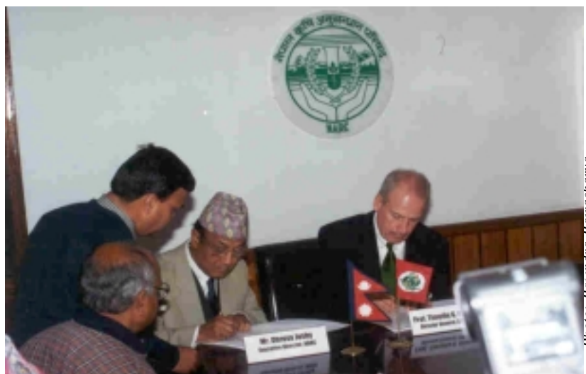
CIMMYT Director General and NARC Executive Director signing the Workplan

The workplan broadly describes the planned collaborative activities between NARC and CIMMYT for the period 2001 to 2003. Proposed activities on maize in the workplan cover GIS, socio-economic surveys, variety and hybrid development and seed production, improved cropping management practices, Small Grants Scheme, improved technology dissemination, strengthening the capacity of NARC. The National Maize Research Program at Rampur is responsible and the nodal center for coordinating maize activities in Nepal..